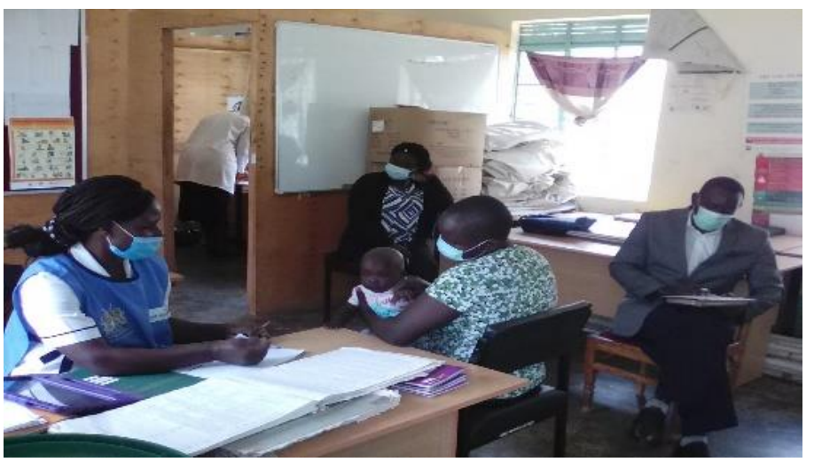
Mentor coordinator conducting health providers training and providing mentorship at facility