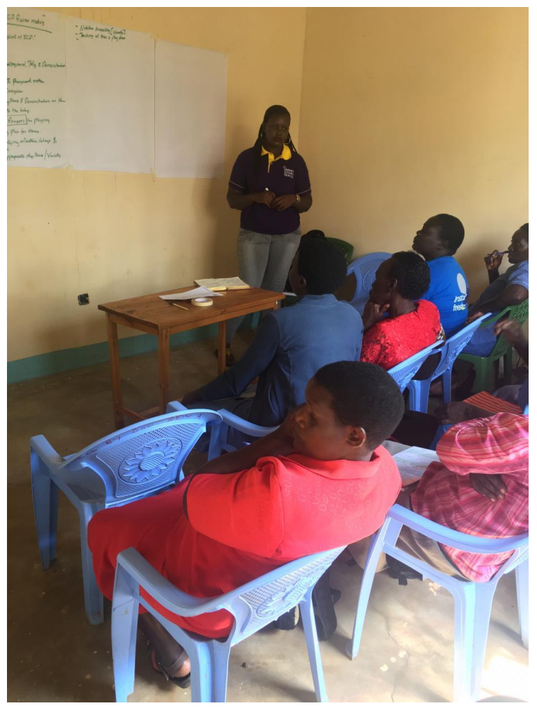
ECD Mentor coordinator Training CHVs

"Our mentor coordinator has been part and parcel of the Sub County health management team. Her role has enabled the Sub County to successfully integrate Nurturing Care into routine health services" (Medical Officer of Health, Alego)