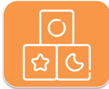
Locally Available Play Materials