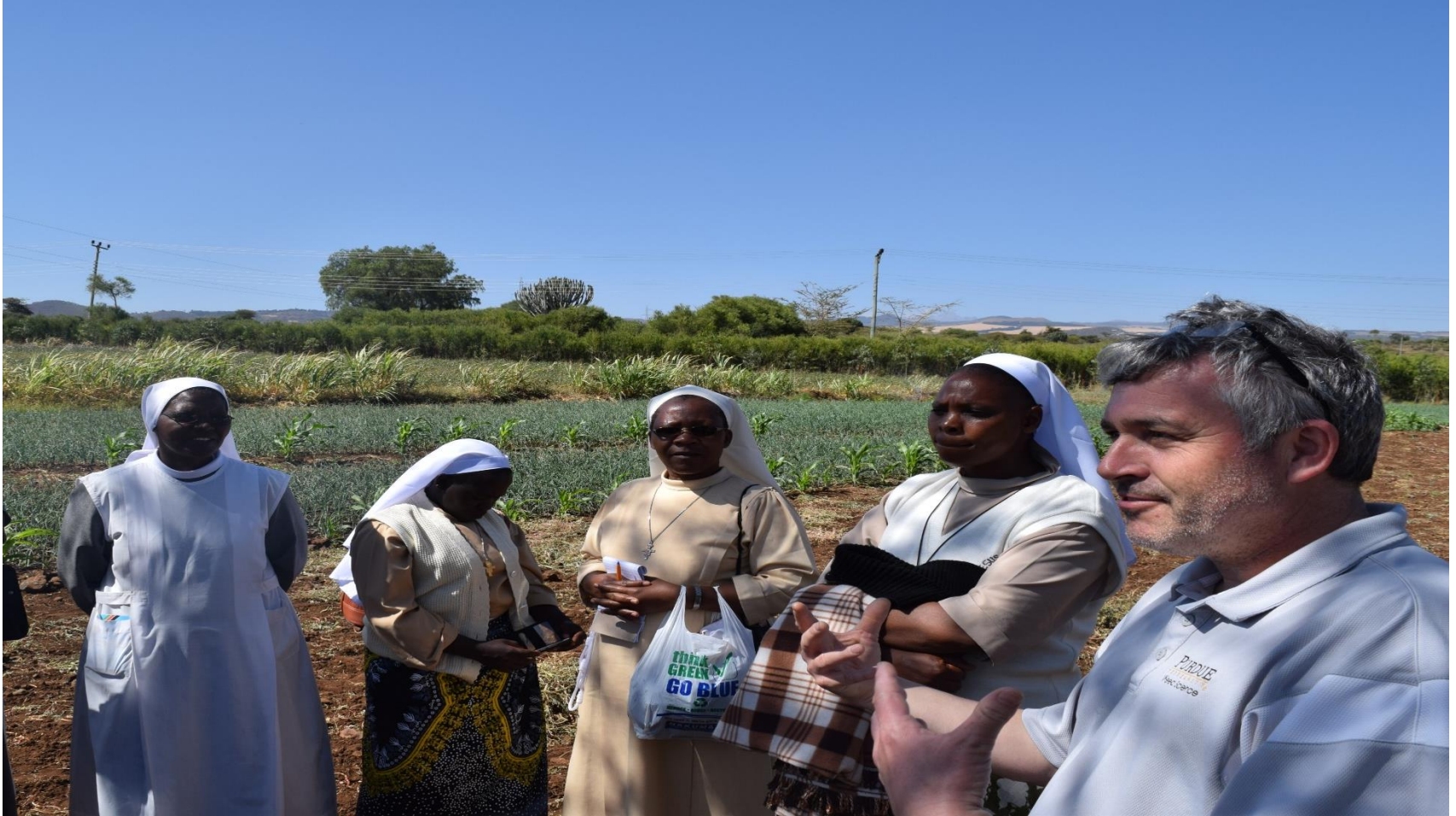
Sisters with one of the Volunteer expatriates in Kiirua-Meru during a training on Farm Management