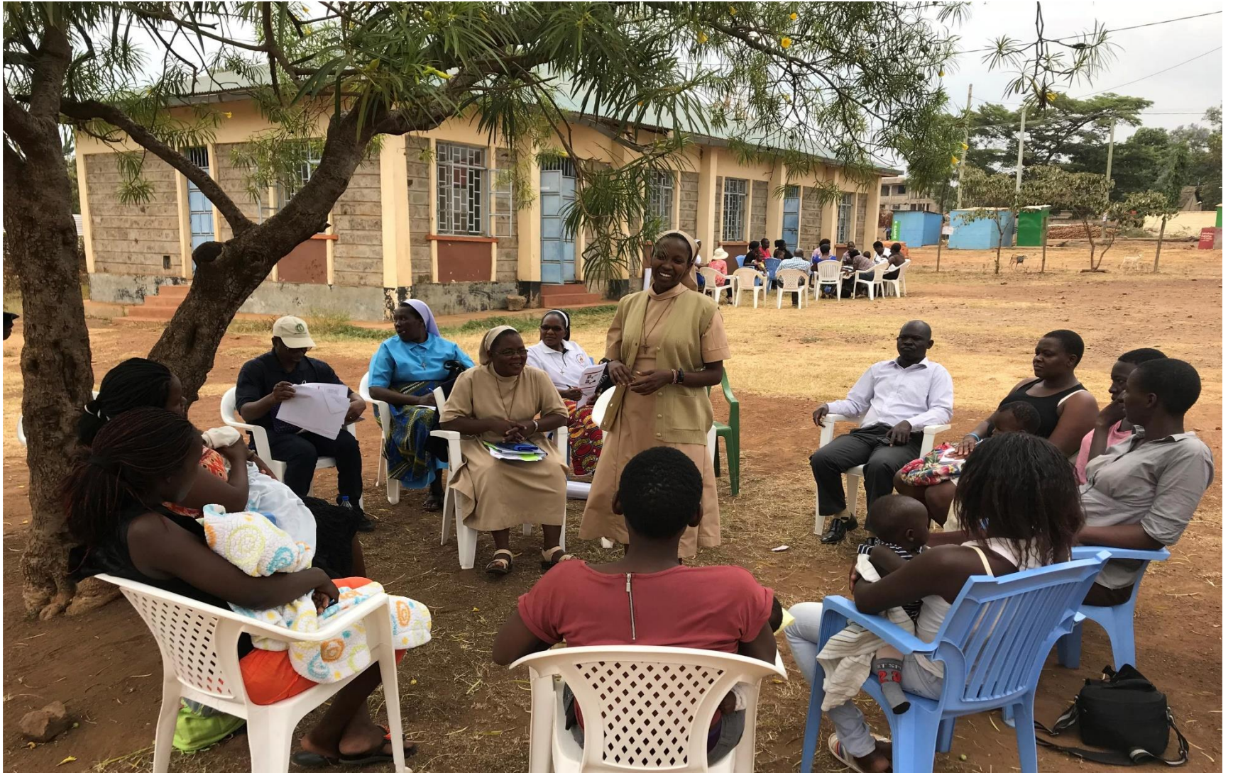
Care Group Session in Progress