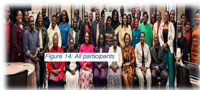
Figure 14: All participants

The National Industrial Training Authority (NITA), in collaboration with key stakeholders in the childcare sector, has developed the Child Caregiver Curriculum III, an initiative aimed at bridging skill gaps among childcare workers in Kenya. This curriculum provides essential training and certification to empower caregivers to deliver quality childcare services, ensuring they are well-prepared to support the holistic development of young children. The ECD Network for Kenya (ECDNeK) joined other stakeholders for the Child Caregiver III Curriculum Validation Workshop, held on 22nd July 2024 at Double Tree by Hilton in Nairobi County. The primary objective of the one-day workshop was to bring together key stakeholders and experts to review and validate the