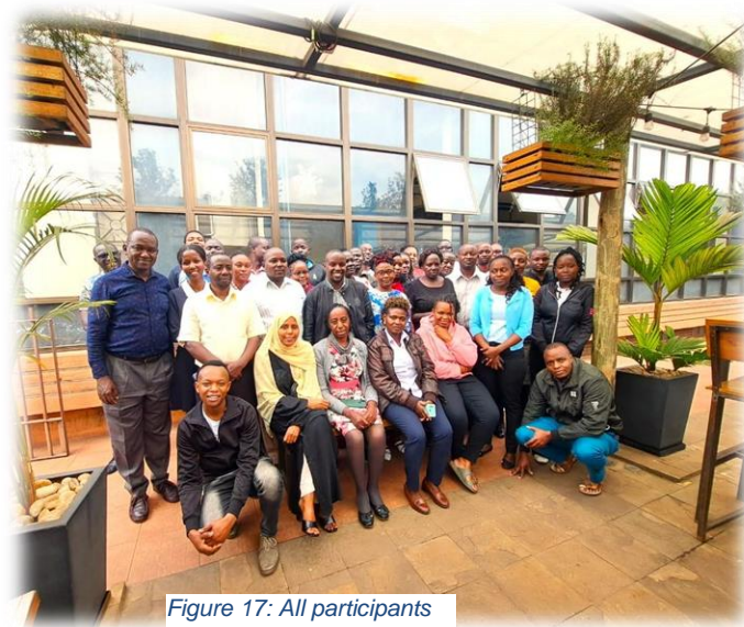
Figure 17: All participants

CCK, an affiliate of Hope Walks and registered as a local NGO in 2019, is dedicated to freeing children and families from the burdens of clubfoot. Through a sustainable, high-impact, and