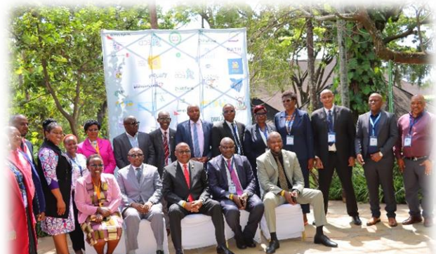
Figure 3: National & County government officials with ECDNeK Board members

The event was officially opened by the Deputy Governor of Nairobi County, who emphasized the importance of collaboration across sectors to improve childcare and protection services. Here's a link to catch up on the highlights. and click here for the communique and report.