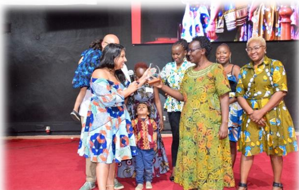
Figure 20: National coordinator handing award to CEO Kidogo

Kidogo, Kenya's pioneering childcare network and a registered member of the ECD Network for Kenya (ECDNeK), marked a significant milestone by hosting its Annual Mamapreneur Gala at St. Andrews P.C.E.A Nyerere Road in Nairobi. The event, held on November 16 th , 2024, celebrated the transformative role of "Mamapreneurs" – women entrepreneurs who are revolutionizing early childhood education and care across Kenya's informal settlements. The Gala, which has become a signature event for Kidogo, highlighted the inspiring stories of these women who not only provide safe and high-quality childcare but also empower entire communities. Kidogo's Mamapreneurs are community leaders who run childcare centers, offering thousands of children access to nurturing, play-based environments that support their holistic development. This year's event emphasized the profound social and economic impact of Kidogo's Mamapreneur Model, which has created a "Triple Impact" across three key groups: children,