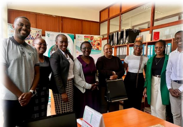
Figure 10: ECDNeK Secretariat & SOS Children's village rep

working closely with national line ministries, county governments, and partners to create a cohesive approach to ECD. As a membership organization, ECDNeK invited SOS to explore its membership guidelines and participate actively in its networking platforms. SOS Children's Villages shared their focus areas, including Alternative Care, Family Strengthening, Education and Youth Programs, Advocacy, and Humanitarian Aid. Operating in counties such as Nairobi, Mombasa, Meru, Eldoret, and Kisumu. SOS further engages in community infrastructure projects like borehole construction, solar panel installations, and toilet facilities. This partnership underscores a shared commitment to ensuring holistic support and opportunities for children across Kenya, paving way for impactful and sustainable interventions.