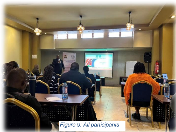
Figure 9: All participants

The ECD Network for Kenya participated in a one-day consultative forum organized by the National Council for Children Services (NCCS) on 10th September 2024 at Ngong Hills Hotel, Nairobi. The forum brought together key stakeholders from the children’s services sector to discuss ongoing NCCS programs, identify opportunities for collaboration, and review the work plan for the fiscal year 2024/25.