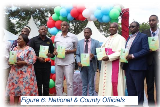
Figure 6: National & County Officials

The ECD Network for Kenya on 20th November 2024, joined state and non-state actors in celebrating the World Children's Day in Murang'a County. Under the theme " Investing in our future means investing in our children, " the event highlighted the shared responsibility of all stakeholders to ensure that every child—regardless of their background, differences, or socio-economic status—has an equal opportunity to survive, thrive, and reach their full potential. The event, organized by the National Council for Children's Services and hosted by the County Government of Murang'a, took place at the Catholic Diocese of Murang'a. A significant highlight of the day was the launch of the Murang'a County Children Policy, which underscores the county's dedication to advancing the Nurturing Care for Early Childhood Development (NCFECD) agenda. This bold step demonstrates Murang'a County's commitment to creating an enabling environment where all children are supported to grow and succeed.