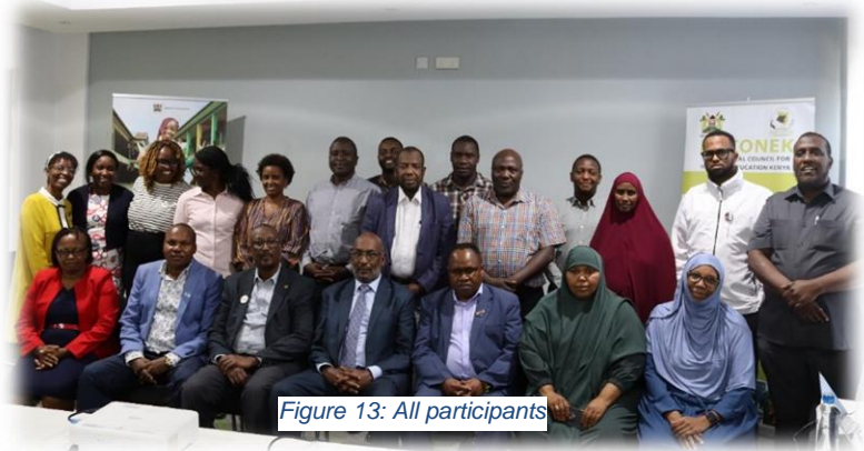
Figure 13: All participants

ECD Network for Kenya (ECDNeK) joined FCDC (Frontier Counties Development Council) and the National Council for Nomadic Education in Kenya (NACONEK) for a two-day workshop at SEO Hotel in Machakos on 23rd and 24th September 2024. The workshop aimed to bring together key education stakeholders in preparation for the 4th Pastoral Leadership Summit that was scheduled to happen in late November 2024 in Wajir Town. The summit's focus was on addressing challenges faced by pastoralist communities, particularly in the areas of education, policy, and financing solutions. The central objective of the workshop was to examine the key challenges hindering education performance across Kenya's Arid and Semi-Arid Lands