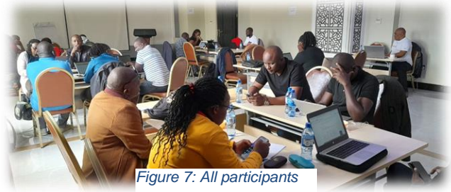
Figure 7: All participants

The ECD Network for Kenya (ECDNeK), alongside other stakeholders, participated in a week-long workshop to finalize the Community Health Promoters Manual and Curriculum. Organized by the Ministry of Health, the workshop was held from 14th to 18th October 2024 in Nakuru County. The event brought together experts from UNICEF, CRS, MCGL, AMREF, PATH, NCCS, DCS, DSD, MOH, and county government representatives from Nairobi, Nakuru, Kisumu, Laikipia, Vihiga, Narok, Kisii, and Homa Bay. Academic institutions such as Kirinyaga University and KMTC were also present, emphasizing a multisectoral effort to enhance community health services. Participants agreed to continue discussions and collaboration through a scheduled hybrid meeting, ensuring progress on the manual and curriculum while promoting stronger partnerships. This initiative highlights the importance of collective action in strengthening community health and advancing early childhood development.