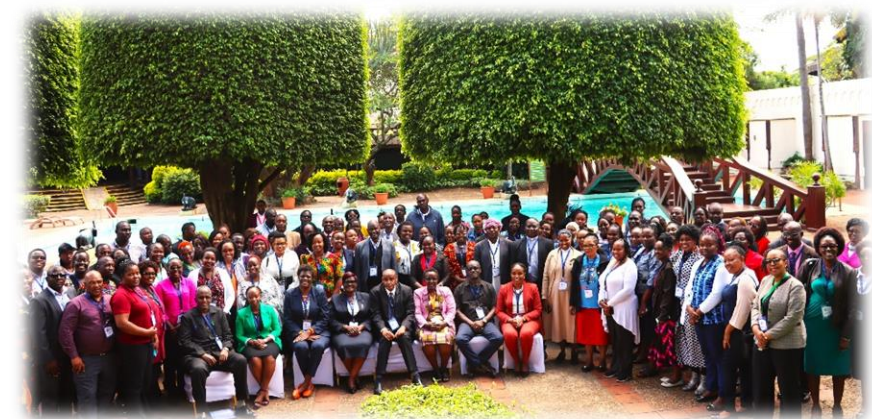
Figure 1: Participants of national childcare dialogue

In collaboration with the Africa Early Childhood Network (AfECN) and other key stakeholders, the ECD Network for Kenya launched the National Childcare campaign from June to December 2024. This six-month campaign, themed “Universal Access to Quality Childcare and Child Protection Services for Children 0-5 Years in Kenya,” aimed to raise