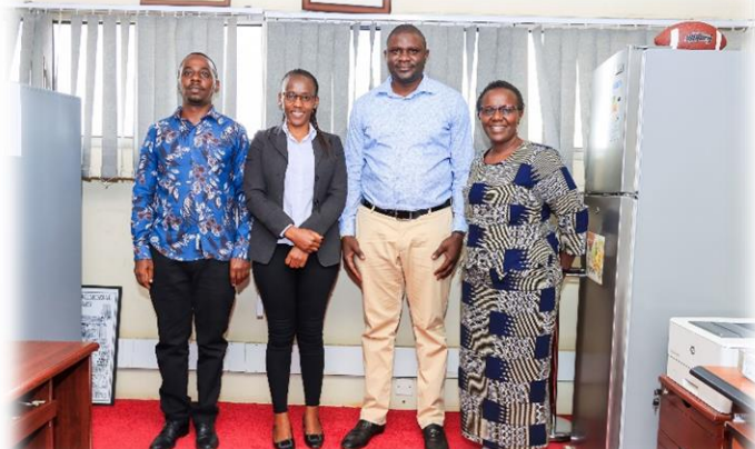
Figure 5: CECM & Deputy Director Education Nairobi County & ECDNeK Secretariat