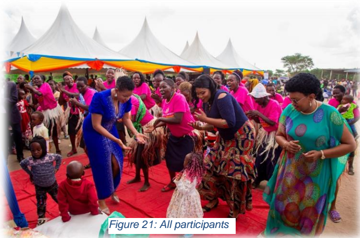
Figure 21: All participants