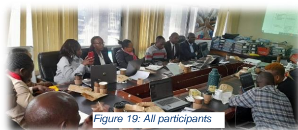
Figure 19: All participants

participants representing diverse stakeholders, including APHRC, Tiny Totos, Kidogo, UNICEF, Wow Mom, Strathmore University, CAC, and key Nairobi County officials such as the Deputy Director of Education, the Director of Education, the Chief Officer of Education, the CECM for Education, and the Nairobi County Advocate.