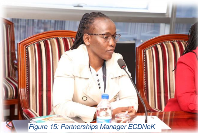
Figure 15: Partnerships Manager ECDNeK

ECD Network for Kenya (ECDNeK) participated in a strategic meeting organized by the Council of Governors (COG) at the Delta Corner offices. The meeting brought together key partners, including UNICEF, Catholic Relief Services (CRS), Plan International, ChildFund, Save the Children, ActionAid, and Safaricom/Mpesa Foundation, alongside representatives from COG and ECDNeK. The primary objective of the meeting was to review the Children Devolution Call to Action