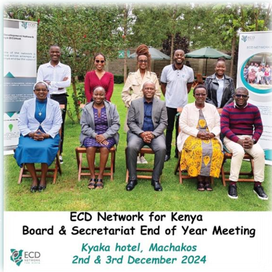
Figure 4: ECDNeK Board members and secretariat

The ECD Network for Kenya Secretariat and Board convened on 2nd and 3rd December 2024 respectively at Kyaka Hotel to review the progress made in the cause of the and strategize