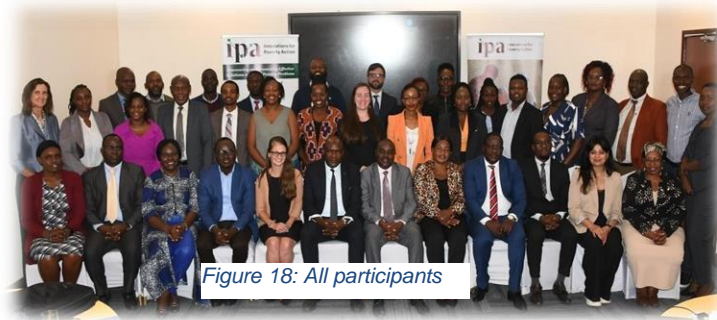
Figure 18: All participants

On August 7th, 2024, the ECD Network for Kenya participated in a workshop organized and co-hosted by the Ministry of Education (MoE) and Innovations for Poverty Action (IPA) held at Panafric Hotel to present the vision for the Education Evidence Hub (EEH) and gather feedback on its lab design and operational plan. This pivotal session brought together heads of MoE departments and semi-autonomous agencies, along with key education stakeholders, including representatives from donors, think tanks, and academia. In Kenya, this initiative is referred to as the Kenya Education Evidence Hub (EEH), which involves teams from the Ministry of Education, IPA, and other key stakeholders. Institutionalized within the existing MoE structures, the EEH is envisioned as a permanent infrastructure owned and operated