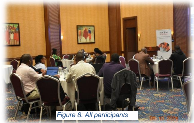
Figure 8: All participants

The ECD Network for Kenya (ECDNeK) joined stakeholders to celebrate the impactful work conducted by PATH Kenya, one of our esteemed registered members, in Siaya and Homabay counties, focusing on scaling up Nurturing Care for Early Childhood Development (ECD) through the Human-Centered Design (HCD) approach. The event brought together key partners, including UNICEF, Lwala Community Alliance, AMREF, Lake Region Economic Bloc (LREB), Nairobi County Health, Division of Newborn & Child Health, Directorate of Food Nutrition & Dietetics, Directorate of Health Promotion, Spinal Injury, National Council for Children's Services (NCCS), Department of Children Services (DCS), and the Ministry of Education (MOE). The ECD Network celebrates the remarkable milestones achieved by PATH Kenya and the invaluable contributions they continue to make in counties where they work.